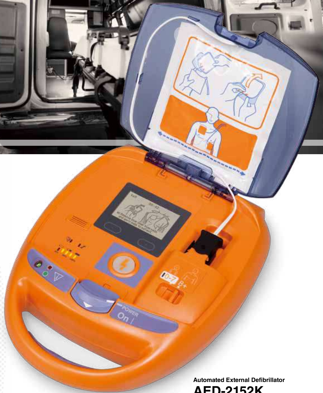
Automated External Defibrillator AED-2152K