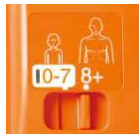
AED-2152K can be used for child by changing pads and mode switch.